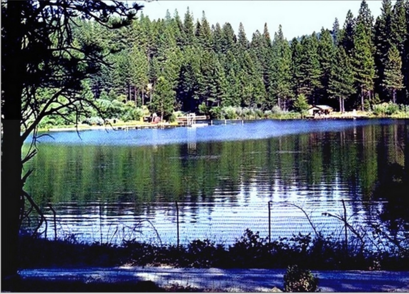
Lake Vera (from Web)