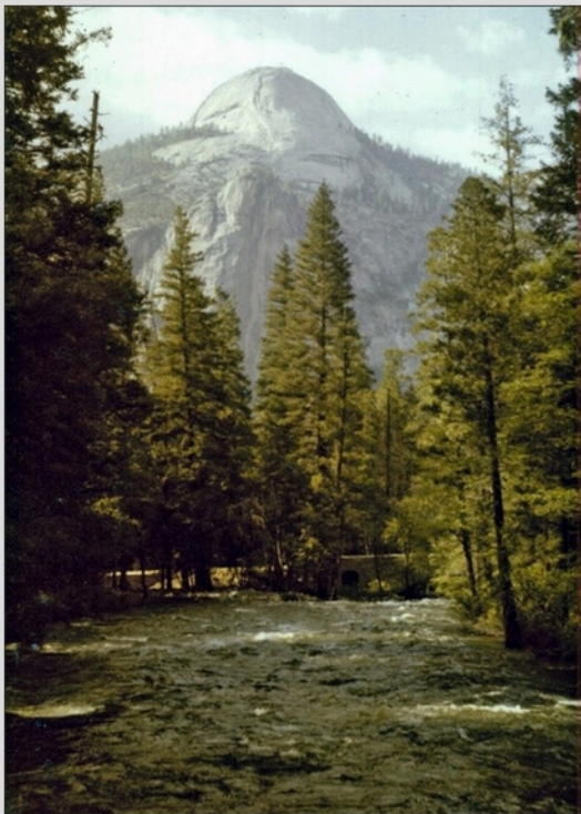
Merced River and Half Dome, 1958