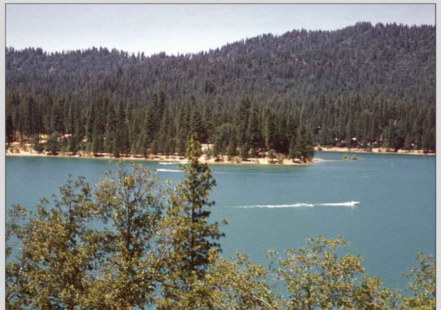
Bass Lake, looking west, 1961