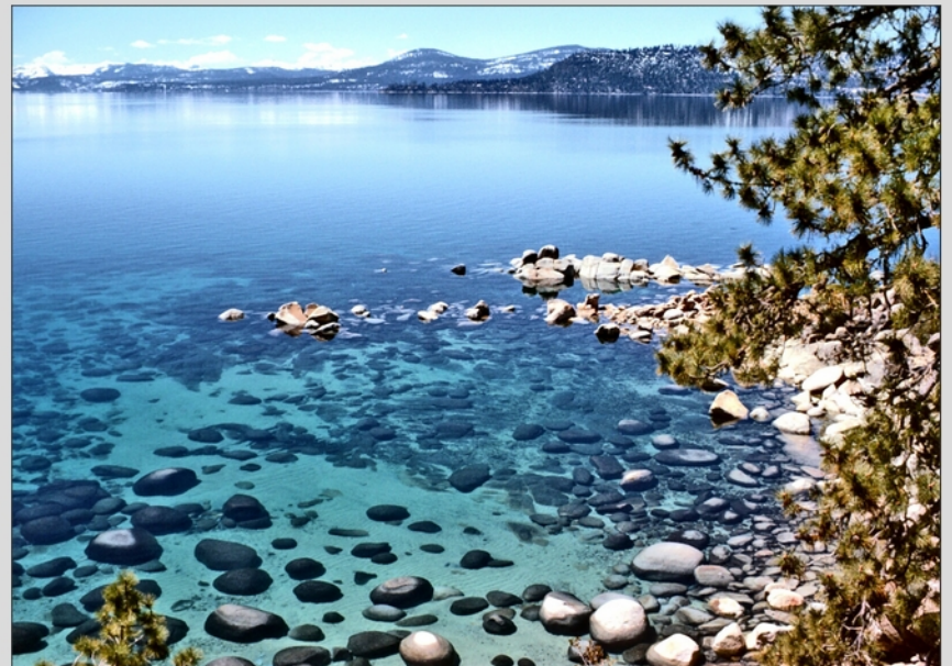
Lake Tahoe shore, 1963