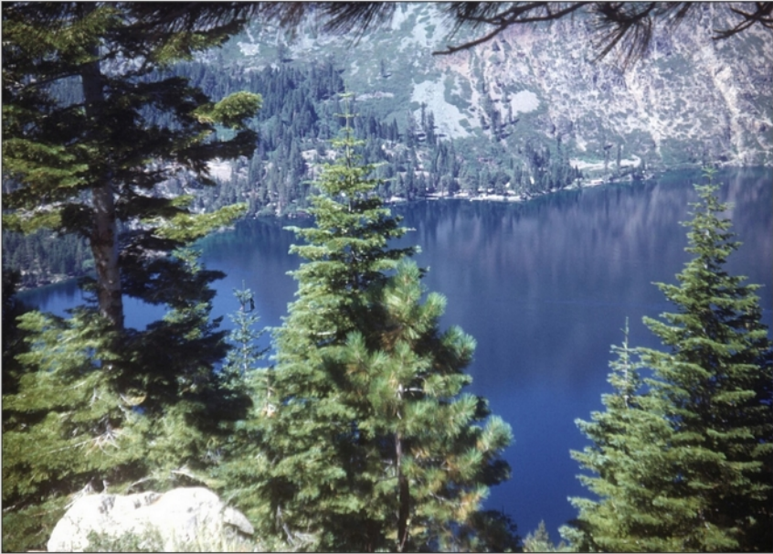
Fallen Leaf Lake, 1950