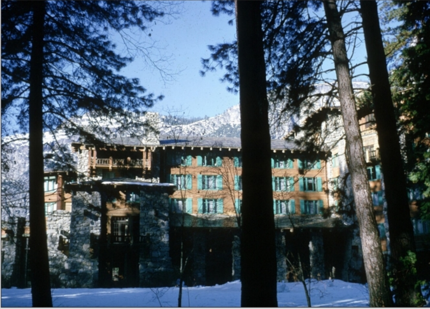
Ahwahnee Hotel, Yosemite, 1965