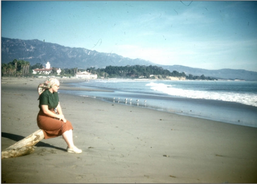
Santa Barbara beach, 1952