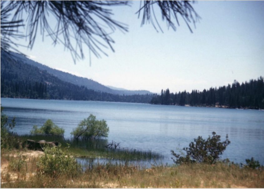
Bass Lake, looking south, 1946