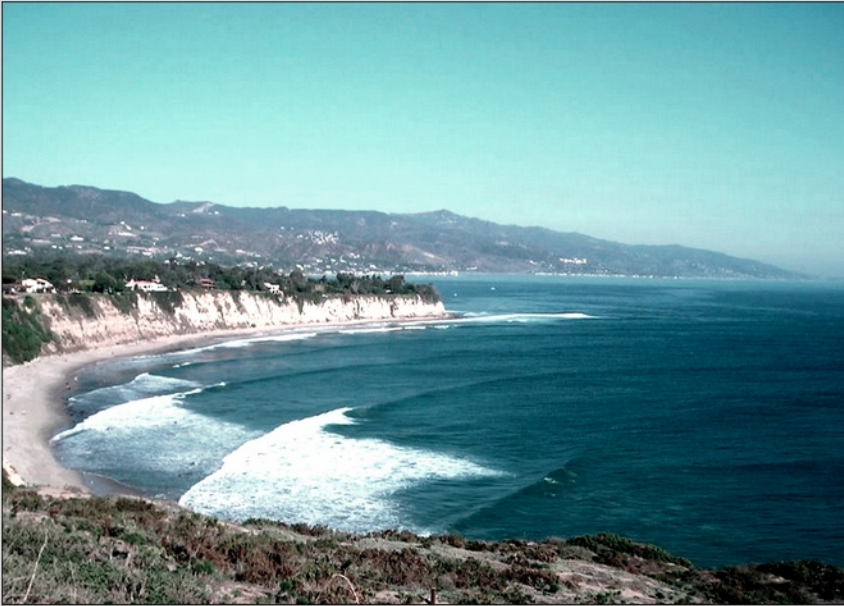
Point Dume (from Web)