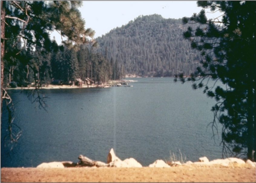
Bass Lake, Goat Mountain, 1946