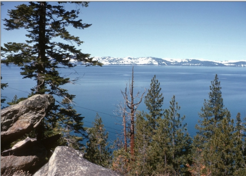
Lake Tahoe, 1963