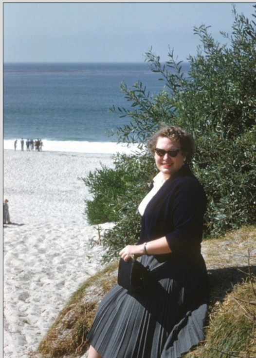
Beach at Carmel, 1960