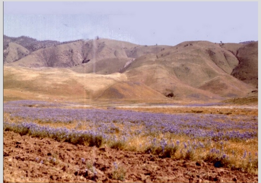
Near Bakersfield, 1958