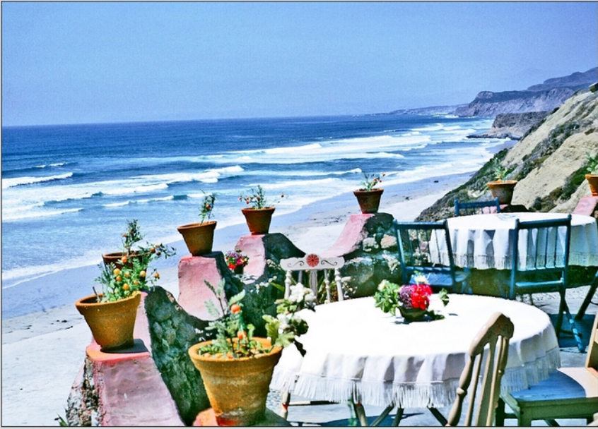
Mexican coast near Ensenada. 1964