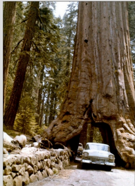
Mariposa Grove, 1958