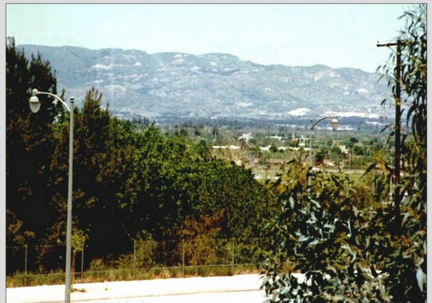
San Gabriel Mountains from Woodland Hills, 1965