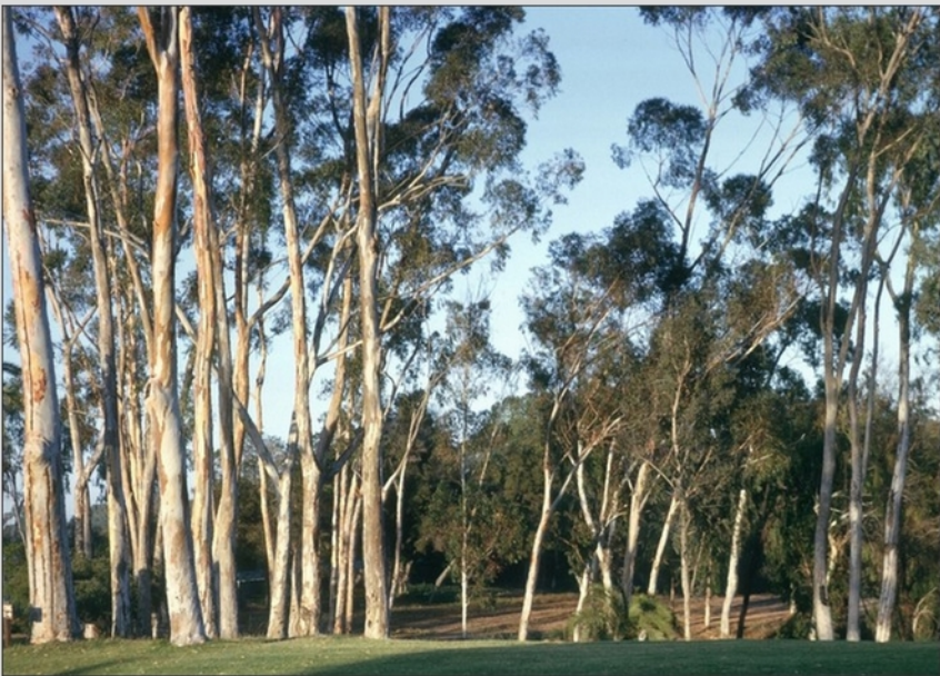
Eucaypti in Balboa Park, San Diego, 1964