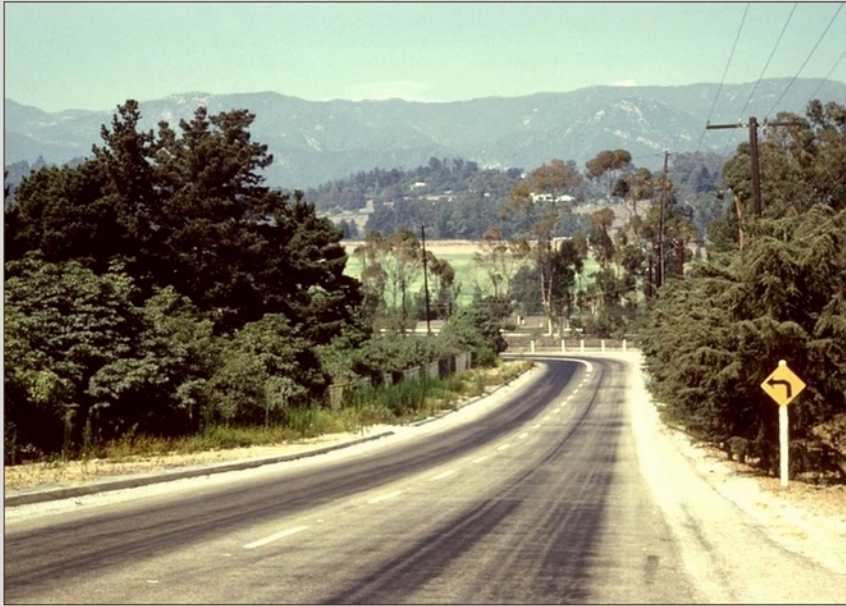
Santa Barbara, approach from south, 1960