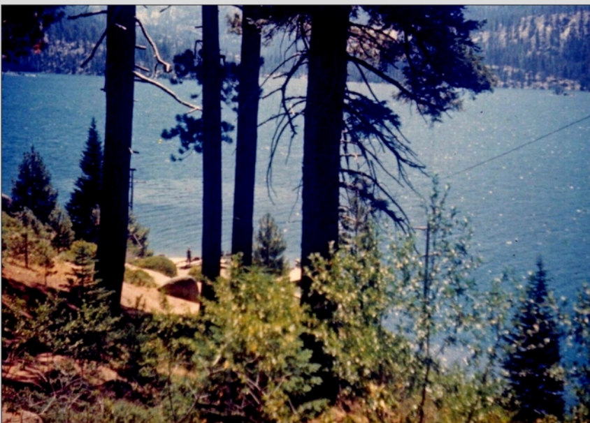
Huntington Lake, 1947