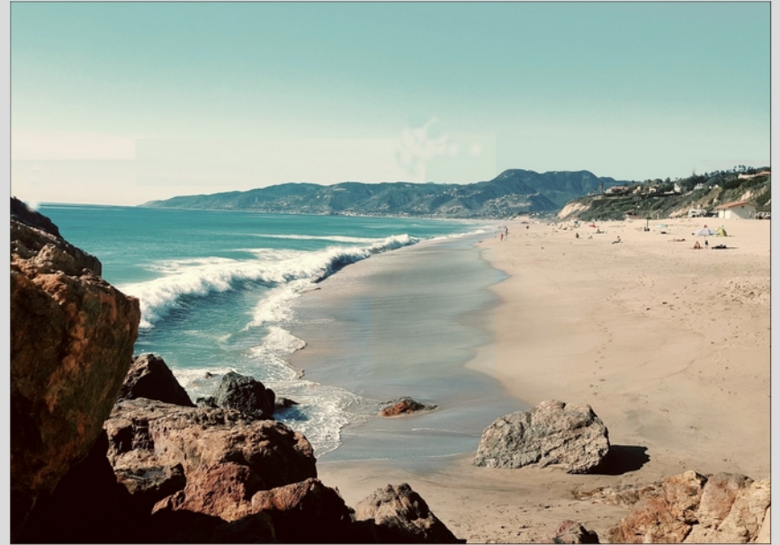
Zuma Beach, Malibu