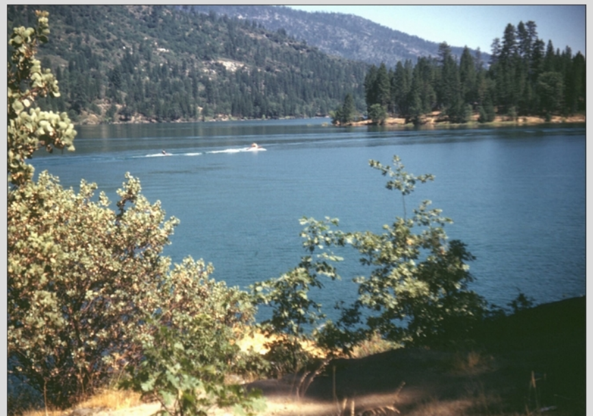
Bass Lake, view from Rocky Point, 1946