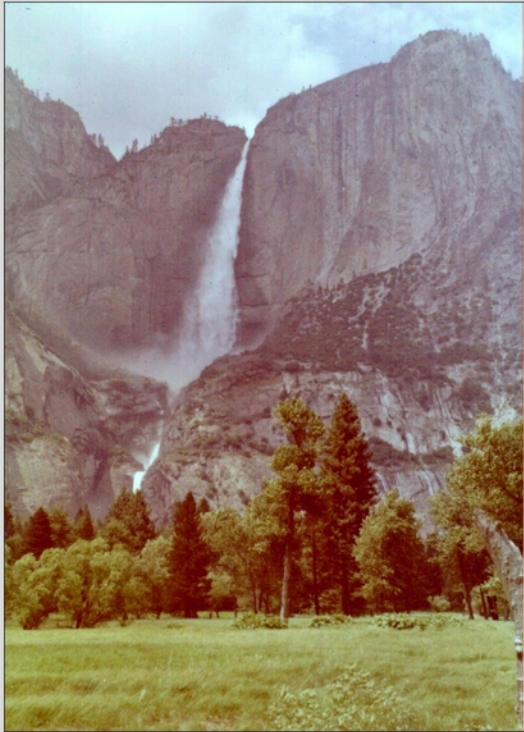
Yosemite Falls, 1958