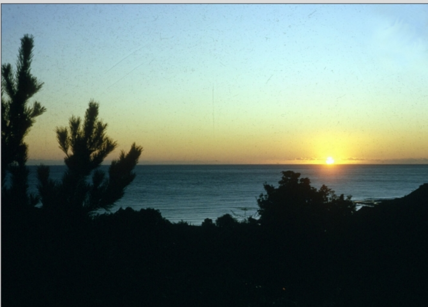
Pacific Palisades, sunset from our patio, 1967