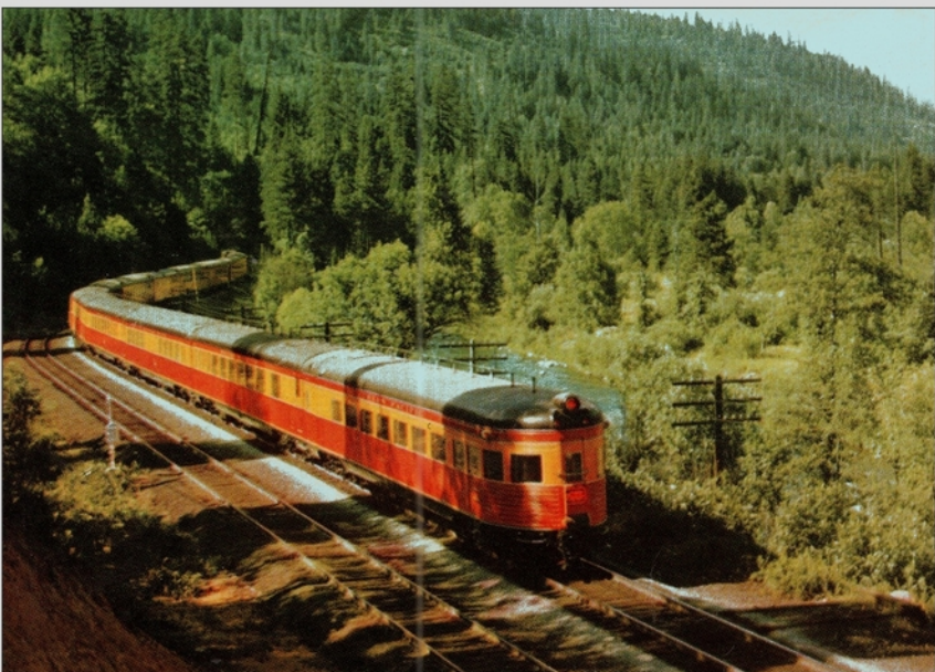
Shasta Daylight (postcard)