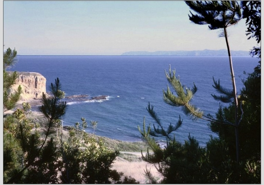
Palos Verdes, 1965