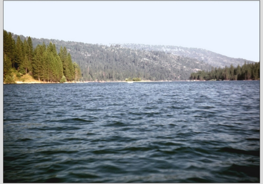
Bass Lake from our boat, 1946