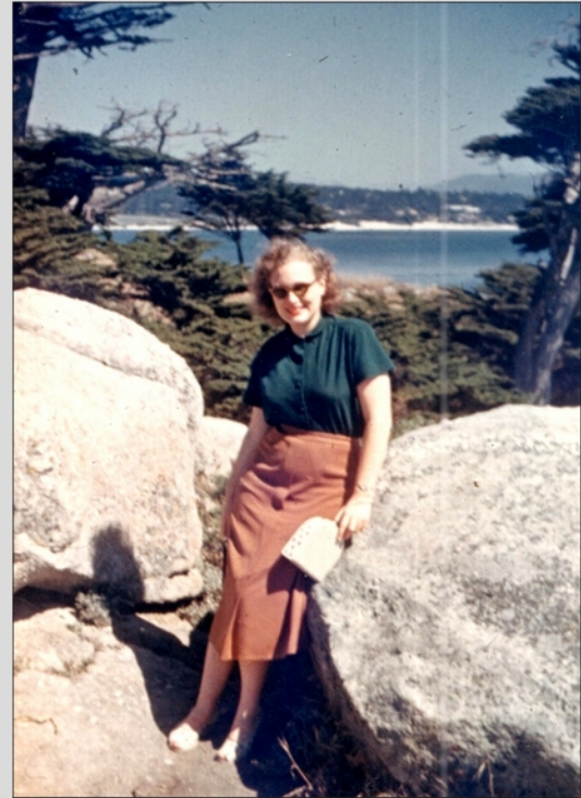
Monterey Peninsula, 1950