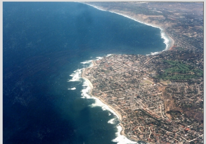
San Diego from the air, 1990