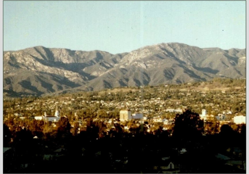
Santa Inez Mountains from Santa Barbara, 1959