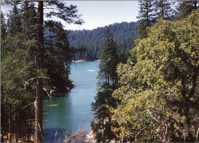
Bass Lake, deep cove, 1961