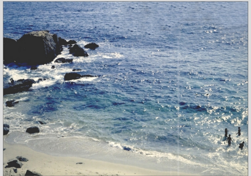
Laguna Beach, 1966