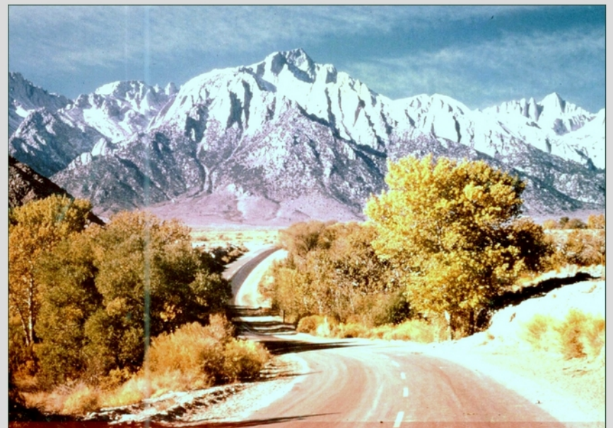
Eastern Sierra Nevada, 1961