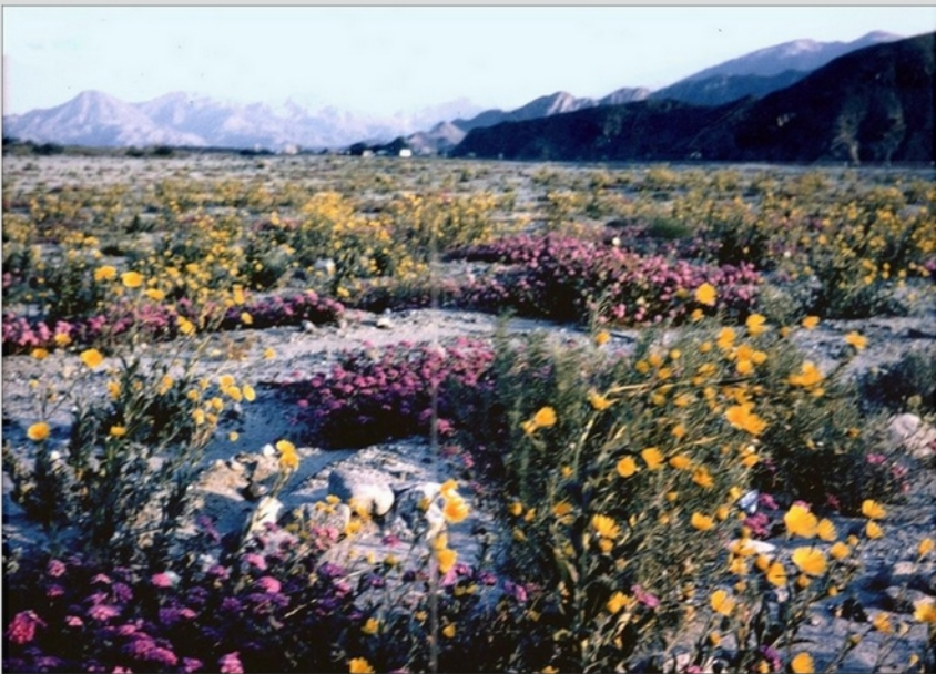
Near Palm Springs, 1963