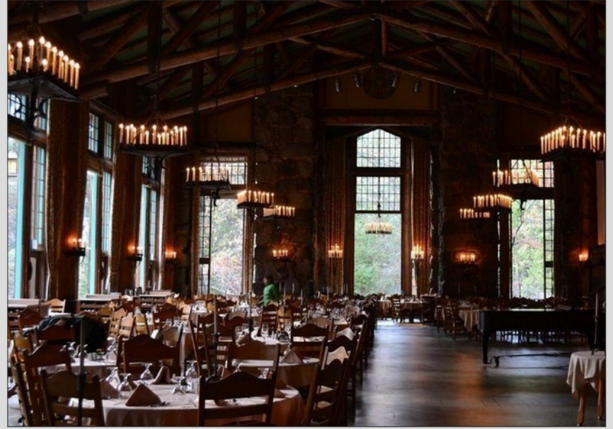
Ahwahnee Hotel dining room, 1965