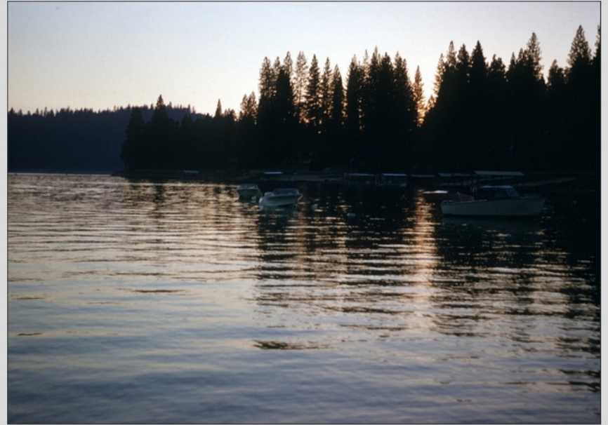
Bass Lake twilight, 1946