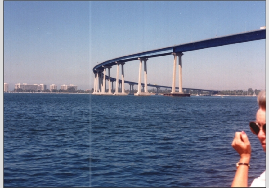
San Diego Harbor, 1990