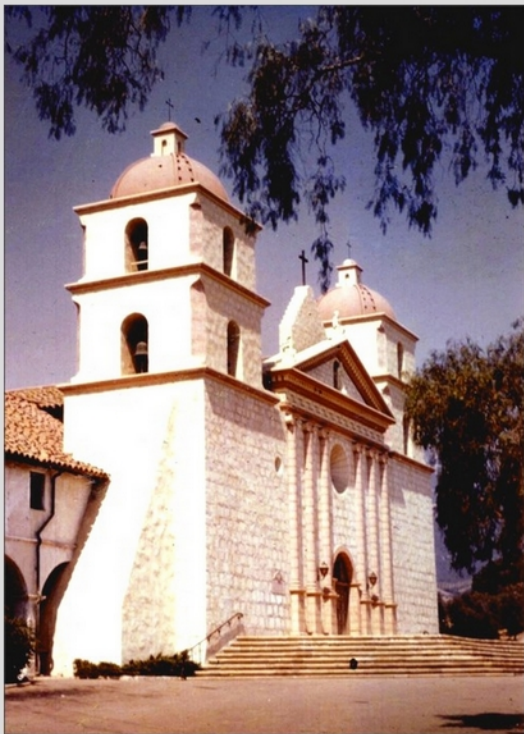
Santa Barbara Mission, 1960