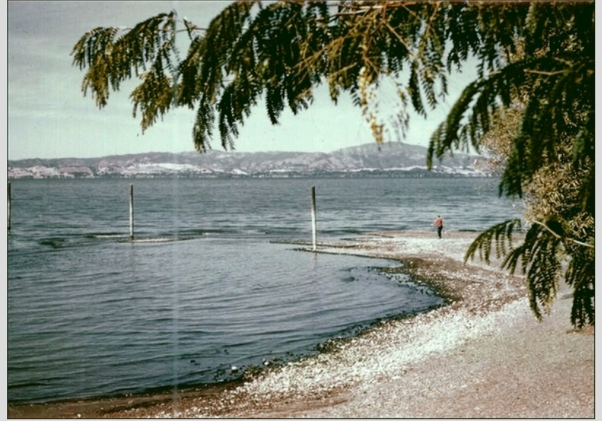
Clear Lake, 1960