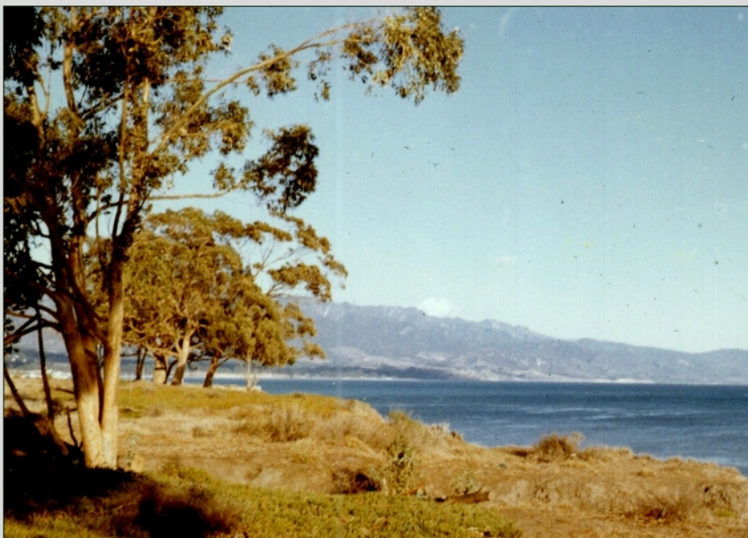
Santa Barbara harbor from the mesa, 1959