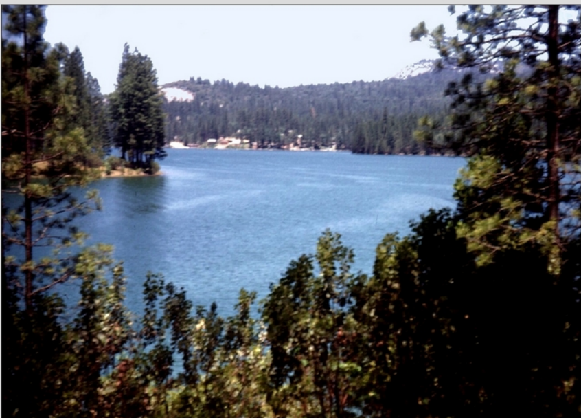
Bass Lake, Pine Point, 1946