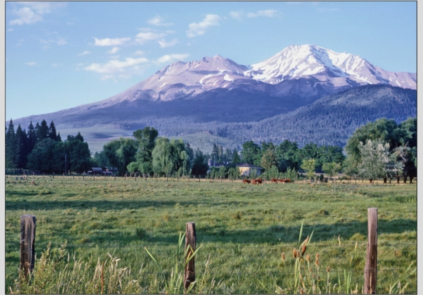
Mount Shasta, 1962