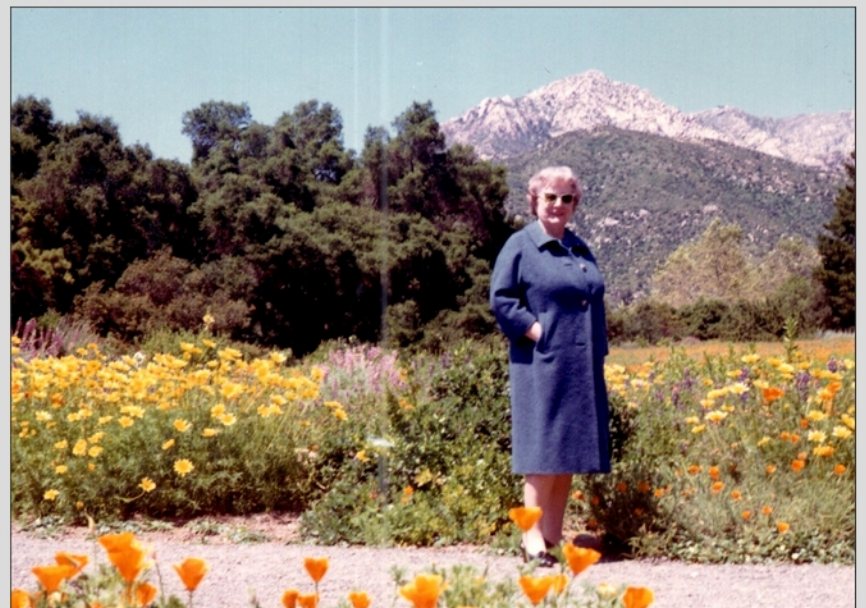
Santa Barbara Botanic Garden, 1967