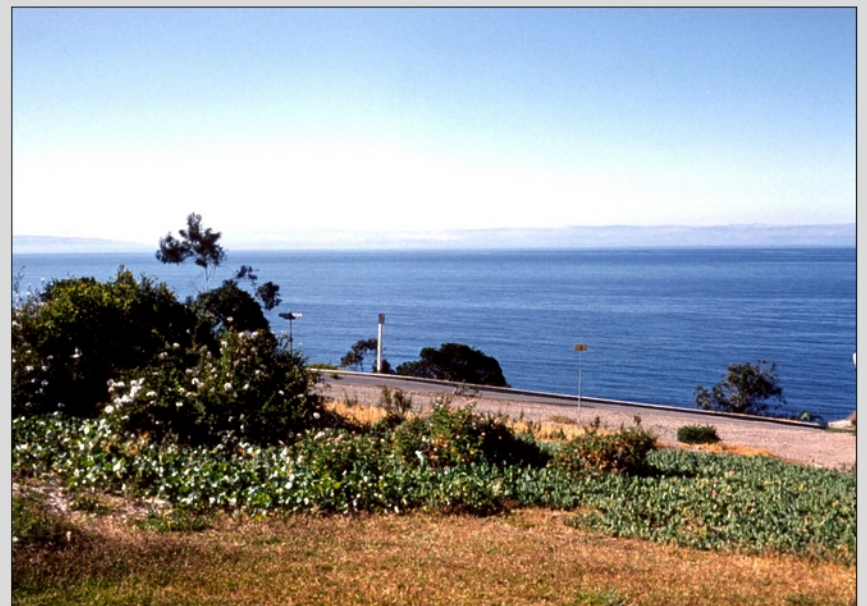
Pacific Palisades, view from our yard, 1961