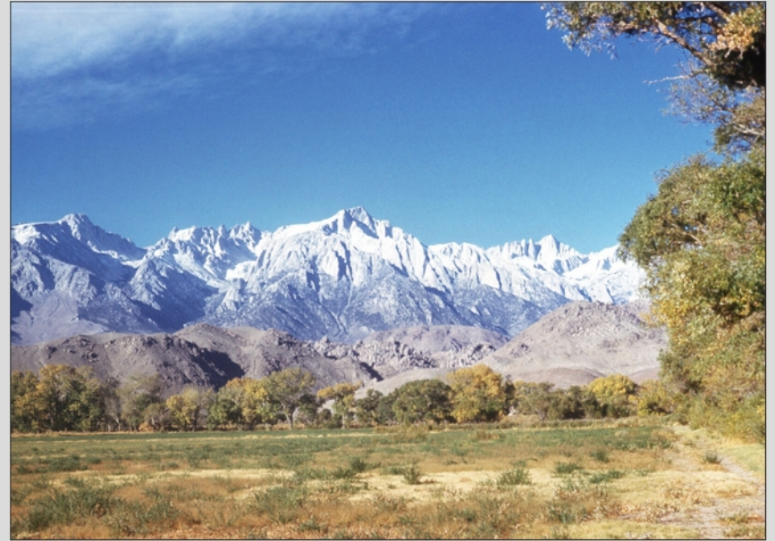
Mount Whitney, 1961