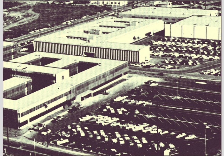
SDC buildings, 1961