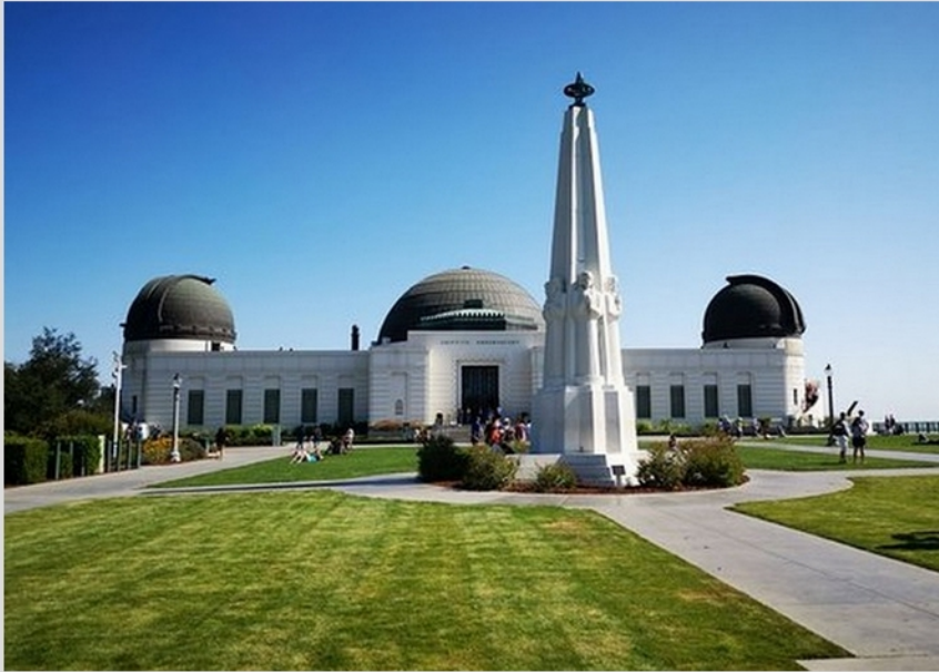
Griffith Observatory