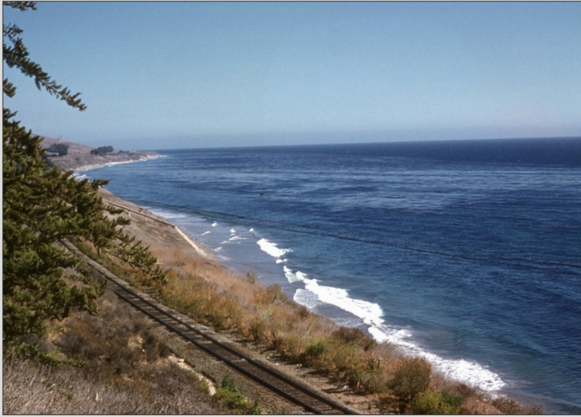
Central California coast, 1960