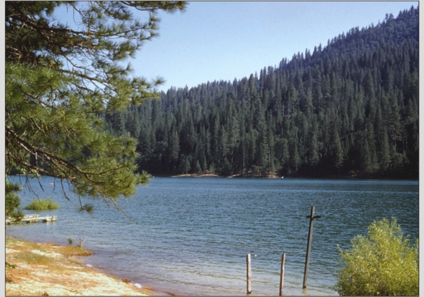
Bass Lake, near The Pines, 1960