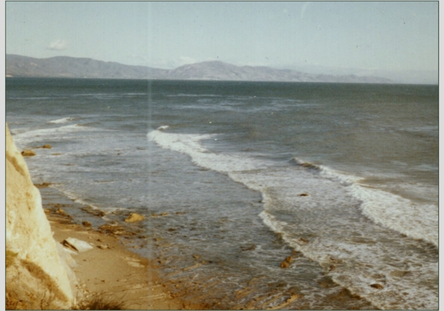
Santa Barbara coast, 1959