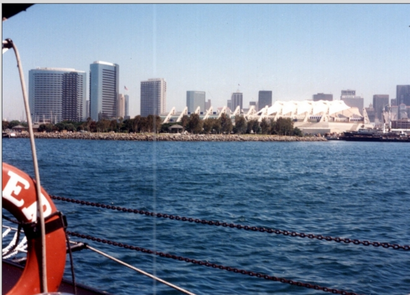
San Diego from boat, 1990