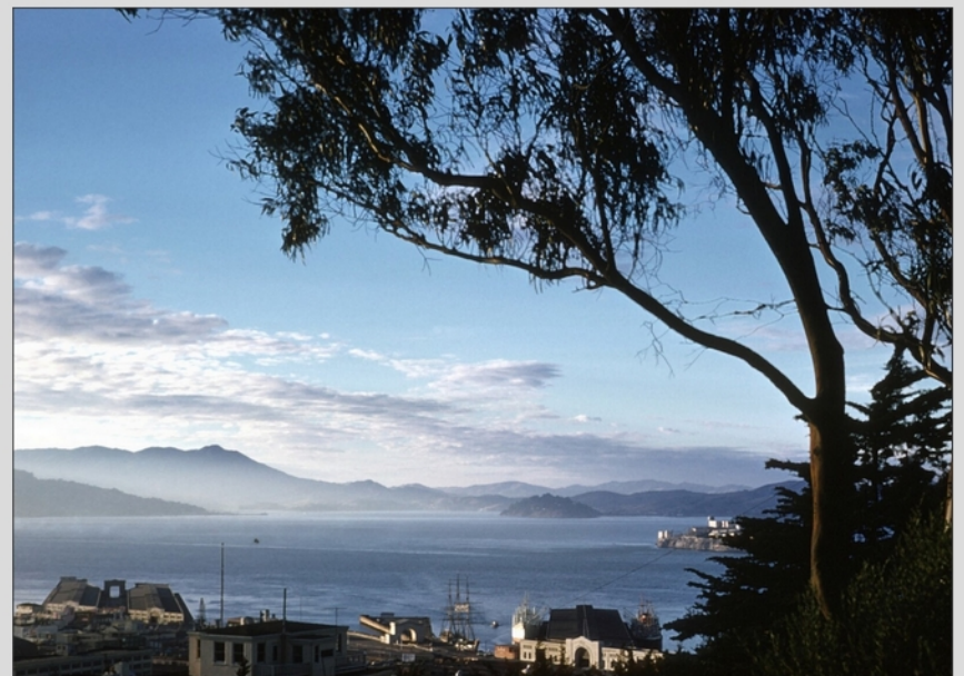
San Francisco Bay, 1960