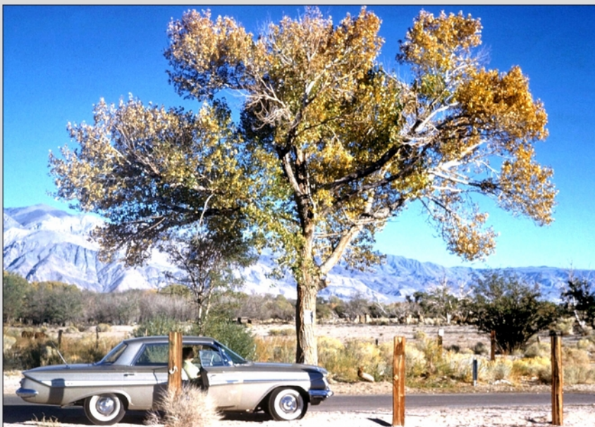
Near Lone Pine, 1961