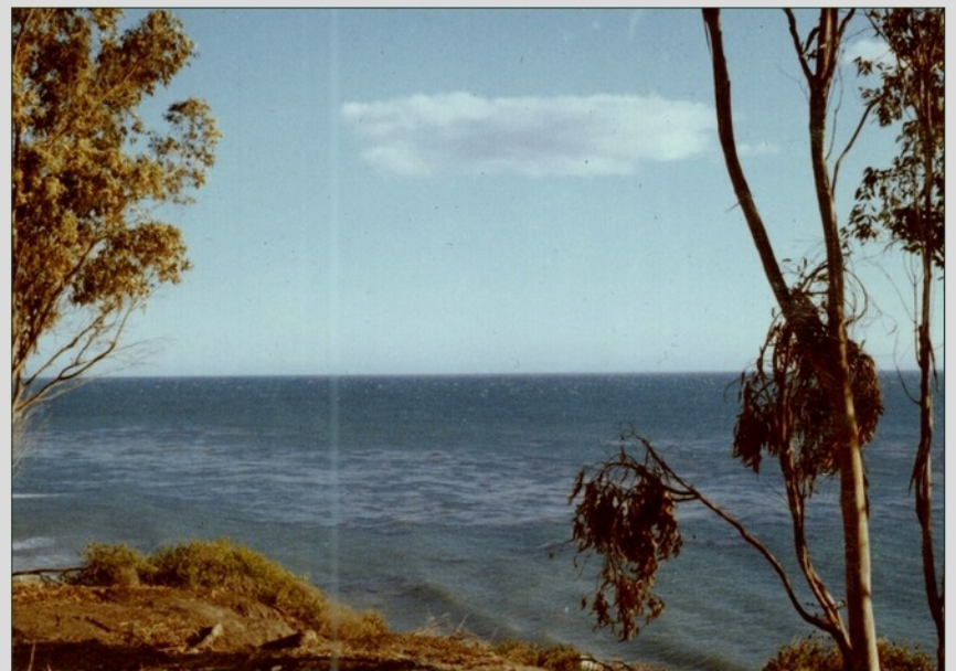
Santa Barbara, view from the mesa, 1959