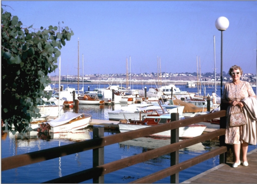
San Diego Harbor, 1964