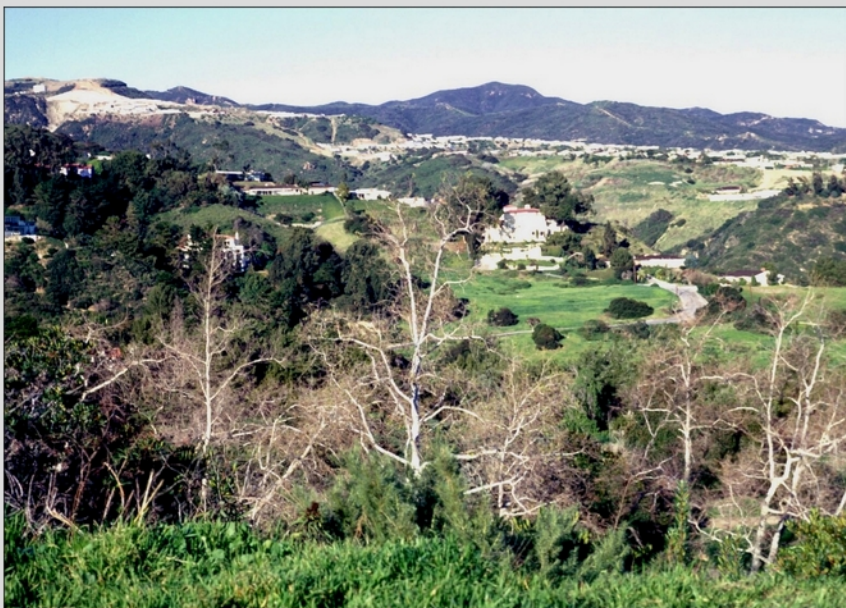
Santa Monica Mountains, 1961