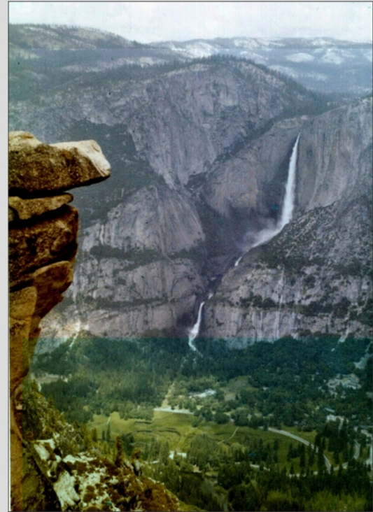
Glacier Point, 1958)