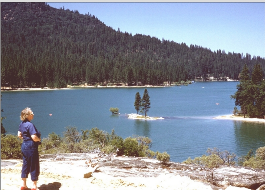
Bass Lake from east shore, 1961